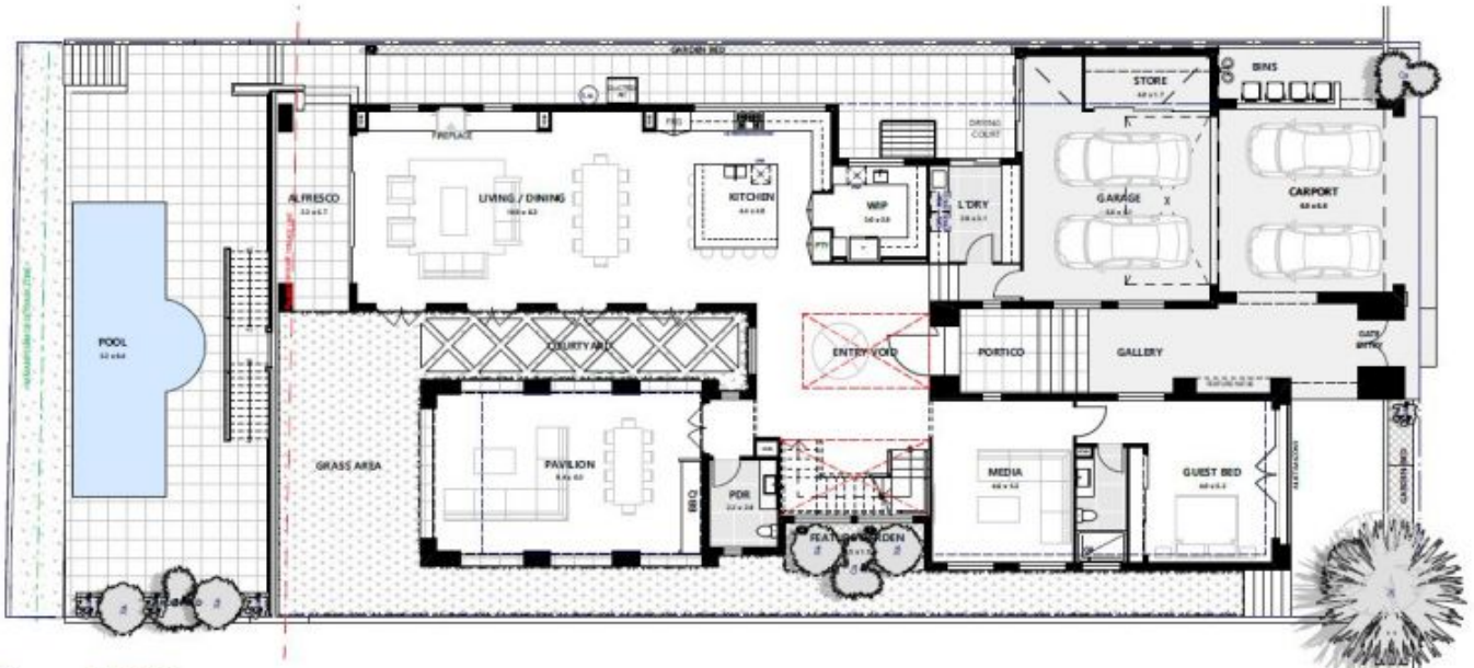
01 FIRST FLOOR 1/125