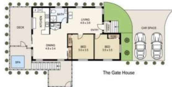
The Gate House