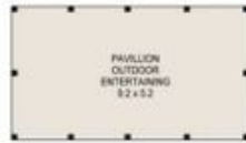
PAVILION OUTDOOR ENTERTAINING 8.2x5.2