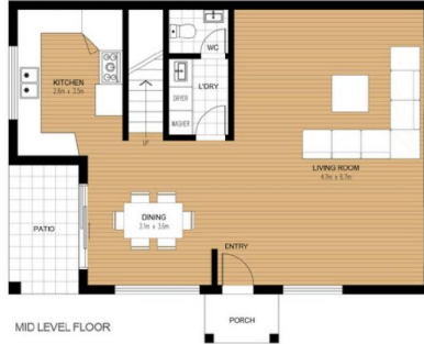
MID LEVEL FLOOR