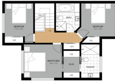
UPPER LEVEL FLOOR