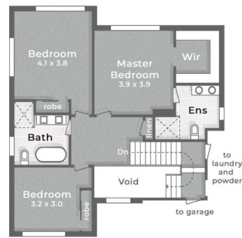
:: FIRST FLOOR