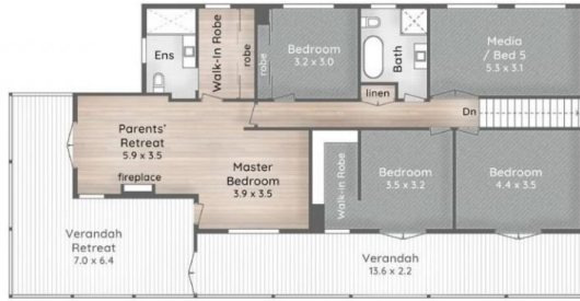
:: FLOOR PLAN First Floor