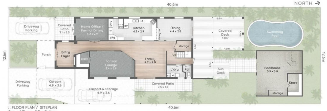
:: FLOOR PLAN / SITEPLAN Ground Floor - 2.7m Ceiling

Whilst Amir Prestige Property Agents have made every attempt to ensure the accuracy of all measurements of this floor plan, Amir Prestige take no responsibility for any errors, omissions, or mis-statement. This plan is for illustrative purposes only.