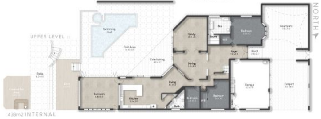
438m 2 INTERNAL