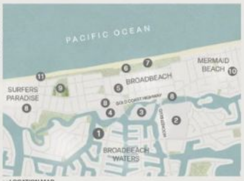
:: LOCATION MAP