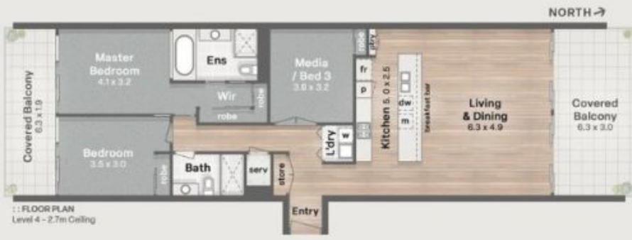
:: FLOOR PLAN Level 4 - 2.7m Ceiling