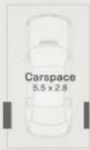
:: FLOOR PLAN Basement

DISCLAIMER: This is not a legal document therefore all measurements and information provided is subject to survey. No permission is given to use or alter this Floor Plan without the consent of Pure Design Concepts. The overall presentation style, layout, imagery, fonts, background, colours and terminology has been originally created by PDC and is subject to strict copyright. No ownership is taken of building design. Find out more at: www.puredesignconcepts.com.au