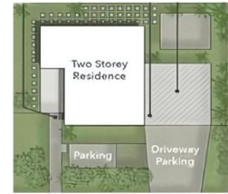
407m 2 * SITE PLAN

BRODIE FOSTER 0478 671 770 FAITH LIU 07 5532 9996