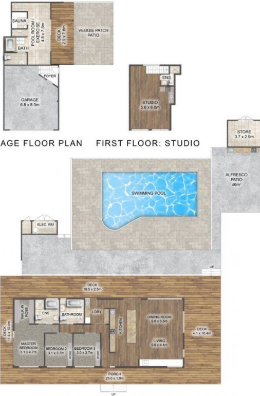
GARAGE FLOOR PLAN FIRST FLOOR: STUDIO