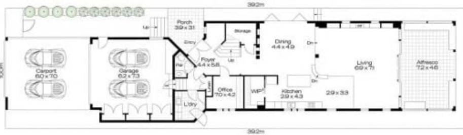
GROUND FLOOR AND SITE PLAN

AMIR MIAN 0401 470 499 CARLIE MILLS 0433 341 896