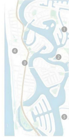
Location Map ::